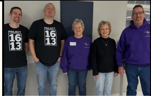
Mission Team to Lima, Peru